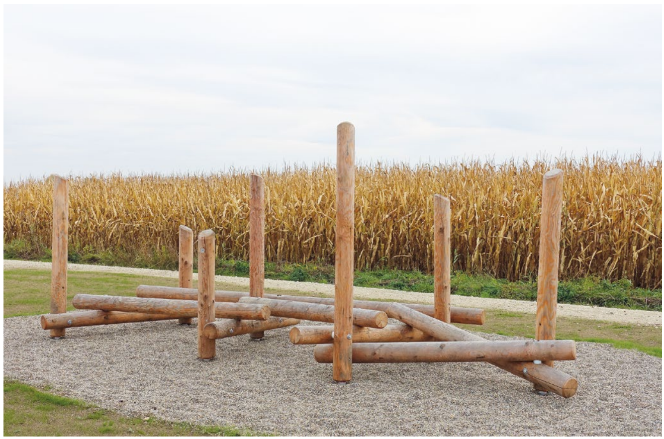
Climbing Structure 20