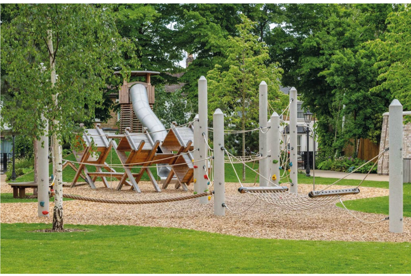
The standard colour of ropes red