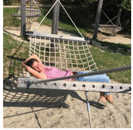
Standard colour of ropes is red.

Our Hammock appeals to young and old alike. Swinging and rocking are connected to the experiences of human beings in many different ways. Children in particular are looking for possibilities to enjoy swinging movement. Lying in the Hammock is even more pleasant when a friendly co-player sets the swing into motion from outside. It is special fun if there are several children in the hammock. Moreover, it is suitable for cross-generational "adventures".