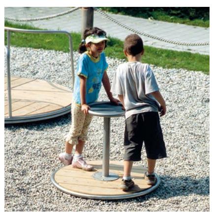
Order No. 6.26500 Turntable