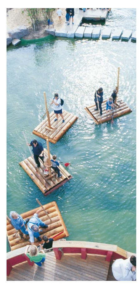
Special version with mast extension

The raft is an associative play equipment which is connected with adventure, e.g. Huckleberry Finn, raftsmen, shipwreck and much more. Children love to move across water with the help of the punting pole. They enjoy the small risk of falling in. Furthermore, it is great fun to experience one's own force and skills. The floating body of the raft is, just as in the case of the cable ferry, a foamed hollow form and assures safe floating. On the raft, there is a mast-type pole to hold on which can also be used in "emergencies" to set a shirt as sail. This watercraft is propelled and steered with the help of a long punting pole.