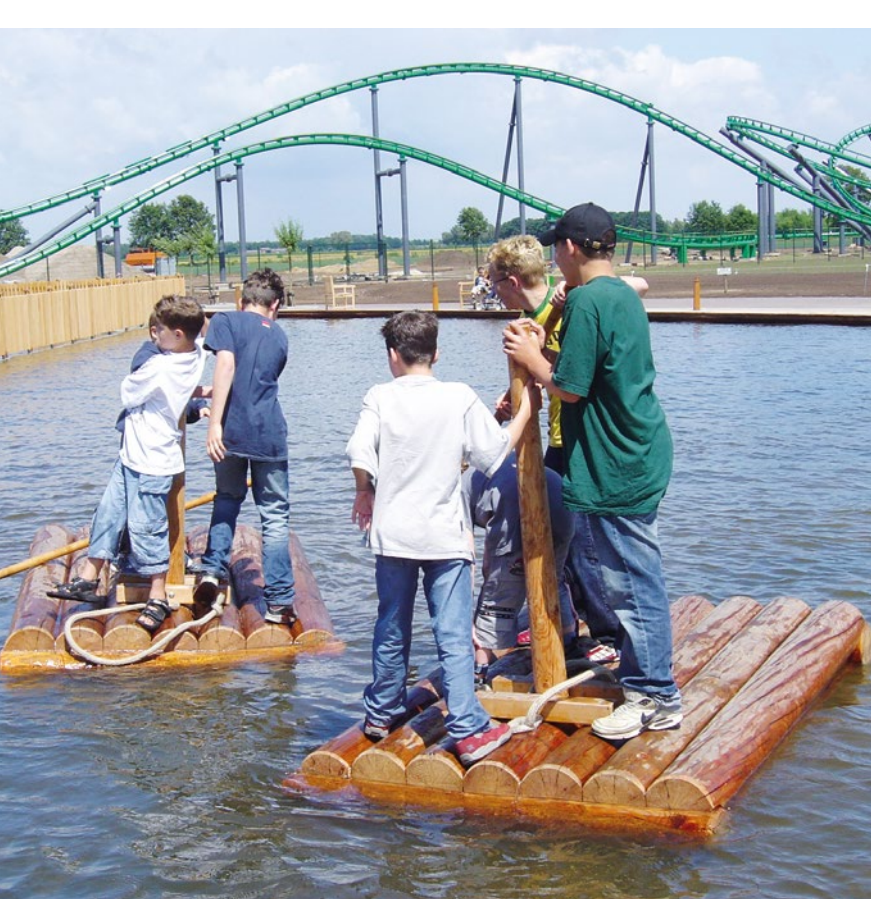
Raft with 1 Punting pole