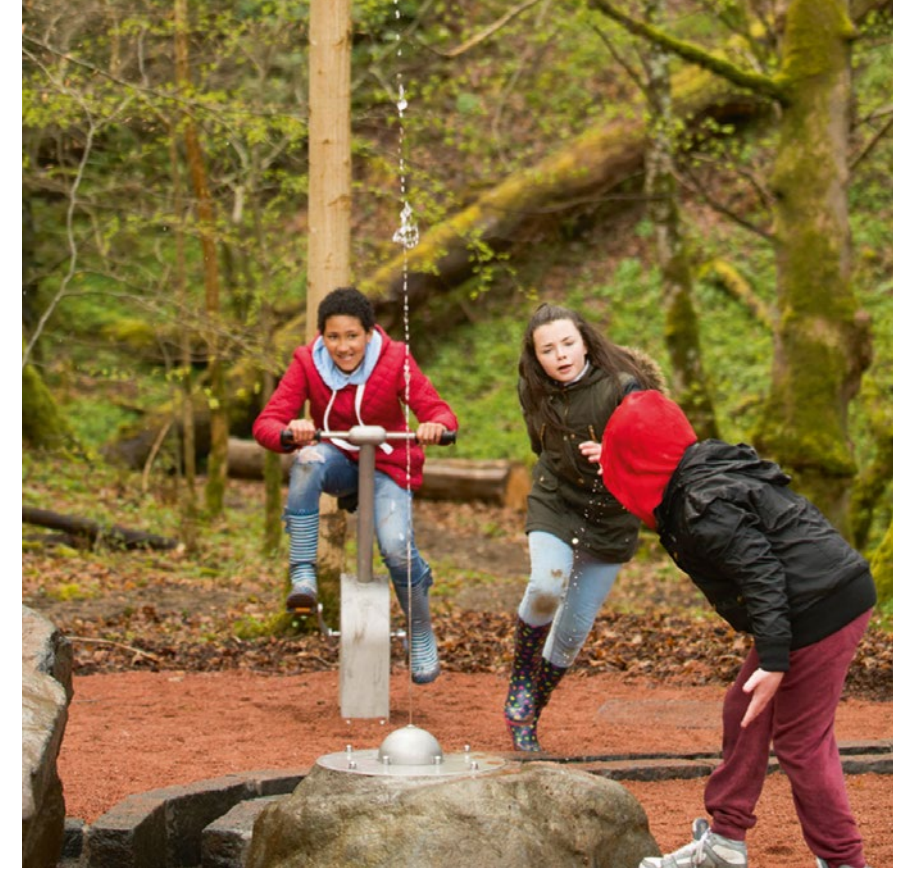
Order No. 5.18130 Pedal Pump with Spray Head in Handlebar

Order No. 5.18230 Pedal Pump for external Spray Head, Photo © Ross Gilmore