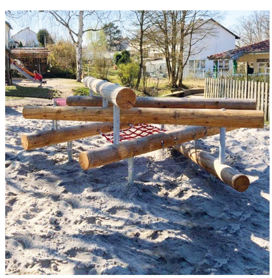
Climbing Stack 4