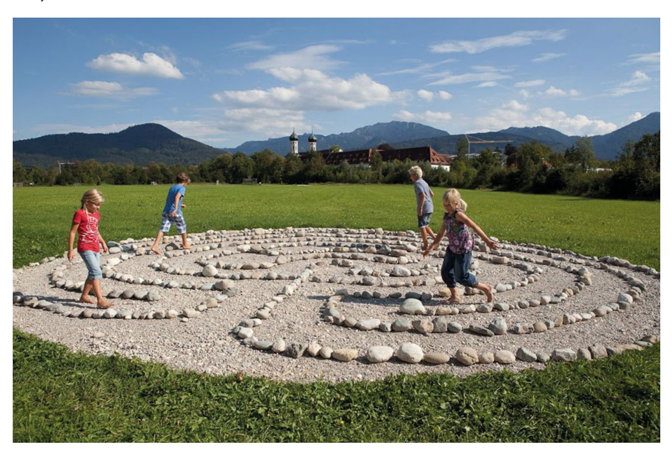
EVOPED® Indoor Labyrinth EVOPED® Outdoor Labyrinth

Level 6: The CAVEMAN in us – being loud means searching for our position. This is how we discover our role in life. Physical power is transformed into speech. Finding our own rhythm. Assuming responsibility, participating in society.