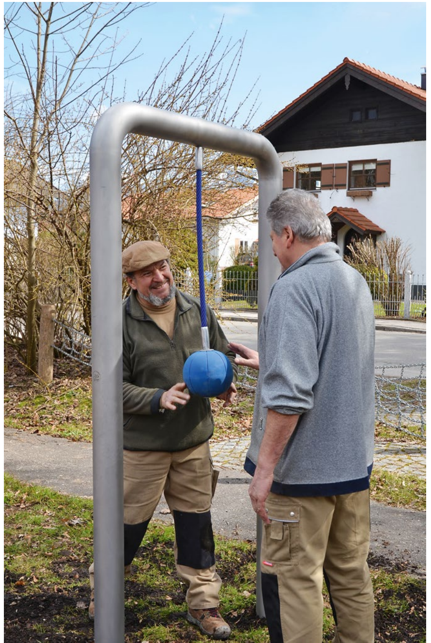
Swinging Ball suspension technically modified.