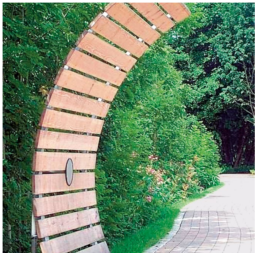
Order No. 10.57100 Listening to Water