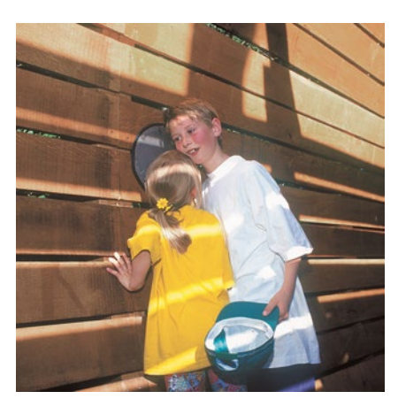
Order No. 10.57100 Listening to Water