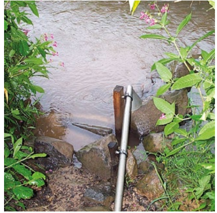
Order No. 10.57200 Listening to Water as Pillar