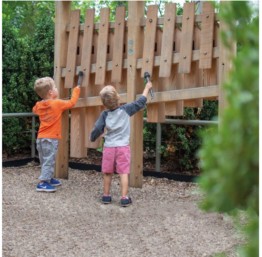
Order No. 10.53002 Dendrophone - double field, Photo © Daniel Perales