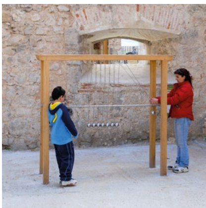
Order No. 10.11000 Impulse Spheres