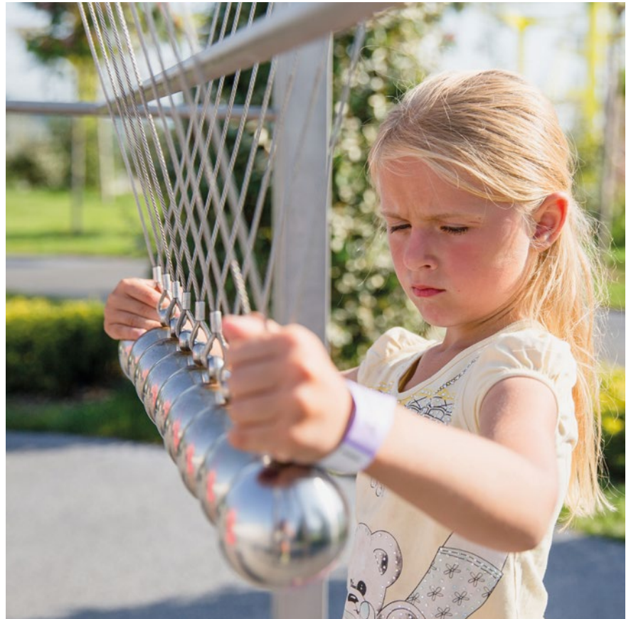
Order No. 10.11010 Impulse Spheres with Frame made of stainless steel