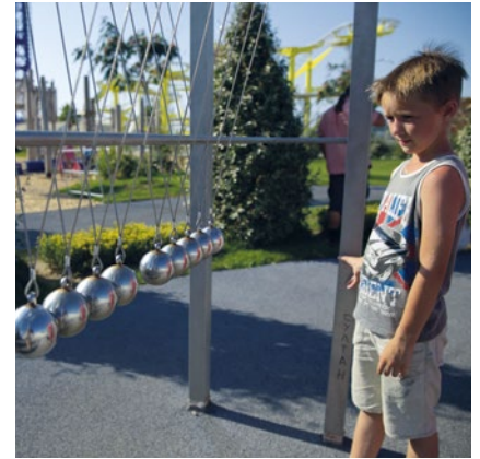
Order No. 10.11010 Impulse Spheres, Frame of stainless steel