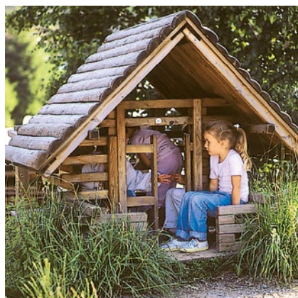
Order No. L4.10110 Small Play House with Door

Small Play House Small Play House with Door Big Play House Big Play House with Door