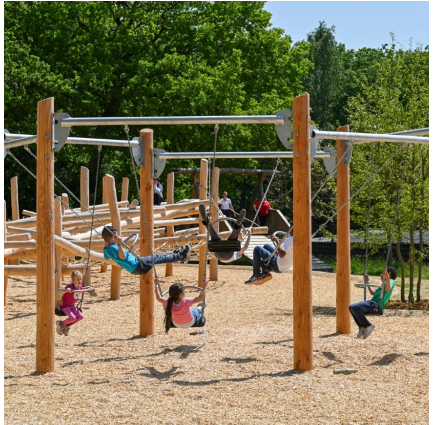
Hexagonal Swing special