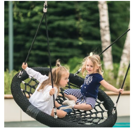
Special colour, Photo © Anton Donikov